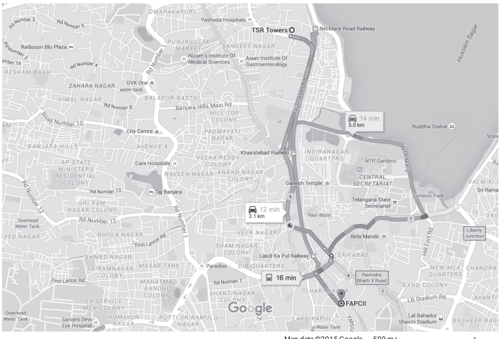
Drive 3.1 km, 12 min